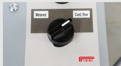
2-functions setting switch Metered/ continuous flow manual-controlled