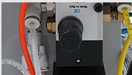
Pneumatic timer Time adjustment of the glue gun which controls the glue dispensing time